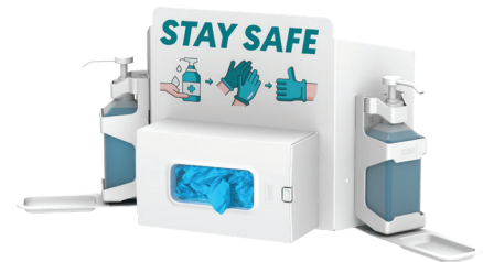
2 Hand sanitizer bottle holders 1 Glove box holder Or 1 Face mask holder