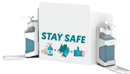
2 Hand sanitizer bottle holders

* Metal plate and accessories will be ordered separately