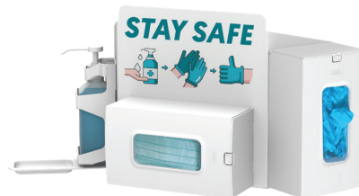
1 Glove box holder 1 Face mask holder 1 Hand sanitizer bottle holder